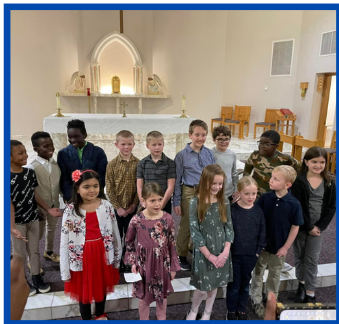
The 2nd grade class at their First Penance