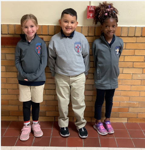
Kindergarteners model the different sweatshirt options.

At the beginning of the year, Blessed Sacrament offered some different options for school apparel. We polled 8 kids from every class and asked them what their favorite sweater or jacket is. The options were grey crewnecks, dark grey zip-ups, or grey quarter zips. The most voted was the grey crewneck with 32 votes. The second most voted was the dark grey zip-up with 28 votes. Then the last most voted merch was the grey quarter zip with 11 votes. In our opinion we like the grey crewneck the best.