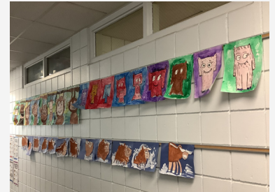
(above) student artwork hung in the main hallway (below) clay fish painted by PK & K students.

You can see all of the different art projects from art class with Ms. Schmidt hanging in the hallway. Preschool and kindergarten just got done painting their clay ceramic projects. First grade just created a clay owl that will be ready to paint next week. Second grade will be glazing their ceramic pig they made, and third grade will be glazing their clay lizard they made. Fourth grade will be working on their clay gnome homes they are building. Fifth graders are working on building a clay coil pot, and sixth grade just finished painting a sunflower still life. Art 1 students are starting their watercolor landscape painting, and Art 2 students are painting a watercolor observation painting.